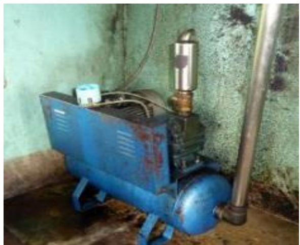
Pump and motor mounted on interceptor/vacuum tank to protect vacuum pump from damage.