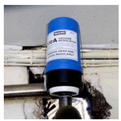
Waikato 170A regulator controls the vacuum level.