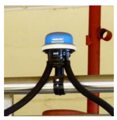
An automatic pulsator to 'rest' the cows while milking. It is mounted on the vacuum line and serves two cows.