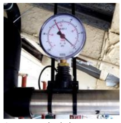
A gauge to check the vacuum level.