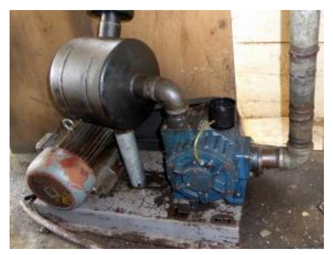
Simple, oil lubricated vacuum.