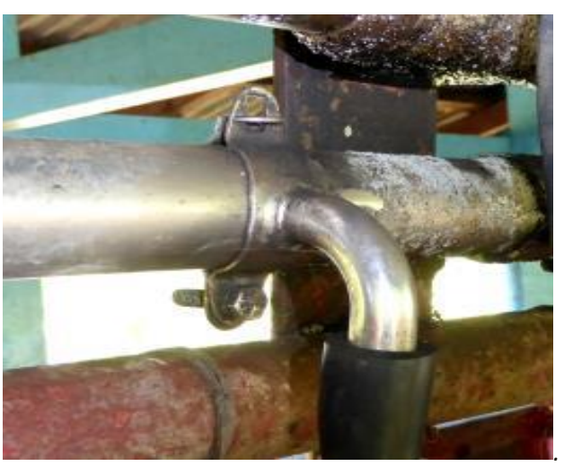
Connection to the vacuum system with clamp-on fitting plus snap clamp as shut-off valve.