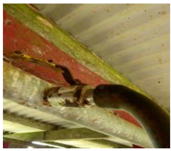
Vacuum connection to vacuum line. One could use a simple snap clamp instead of the valve.